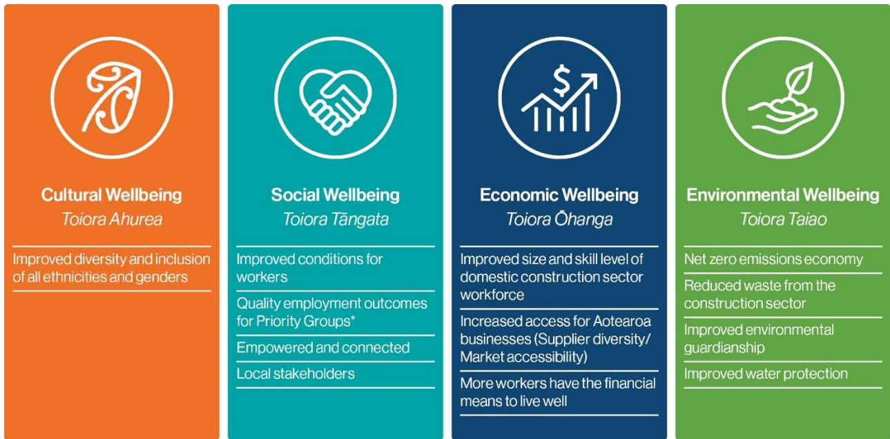
Figure 2: Broader categories (taken from the Construction Sector Accord guidance)

Not all categories/subcategories will apply to every tender – the specific opportunities and outcomes identified for a project or contract will depend on the nature, size and scope of the healthcare facility and the works, services and benefits being sought.