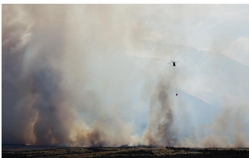
Figure 1: Lake Ōhau blaze, October 2020

These predictions appear to be being realised. Significant wildfires in New Zealand in recent years include the Port Hills fire in Canterbury in 2017, the Chatham Island wildfire of 2018, the Pigeon Valley fire near Nelson in 2019, and the Lake Ōhau and the Pukaki Downs fires in 2020. These fires damaged tens of thousands of hectares of bush, destroyed houses and property and resulted in one loss of life.