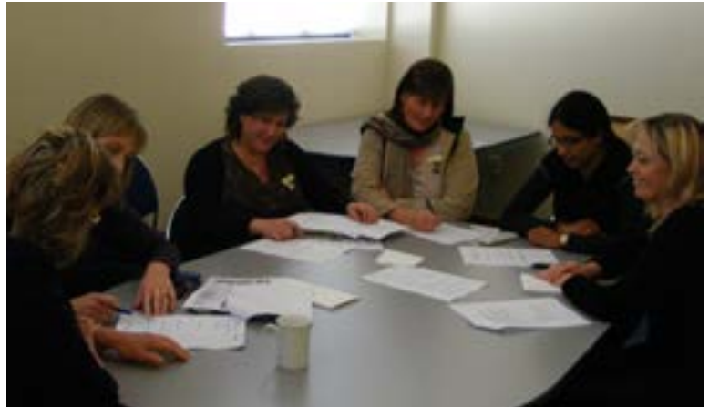
The family violence champions at The Hastings Health Centre