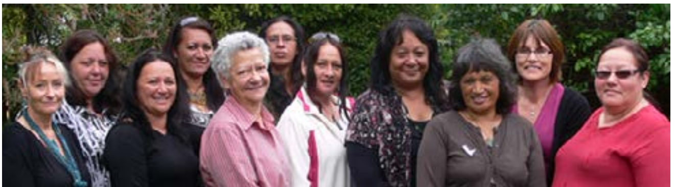
Kaimahi - the staff at Te Puna Oranga

“We're trying to get families to a place where they're self-sufficient”