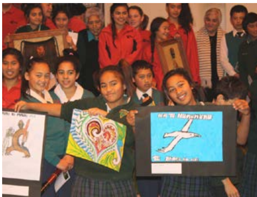
Minister Tariana Turia with whānau ora art competition entrants

“At the end of the day it’s about Māori looking at the work we’re doing within the VIP programme and actually having genuine input.”