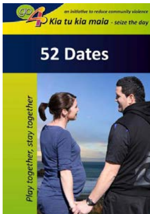
The Wairarapa Kia Tū Kia Māia resources feature images of local people