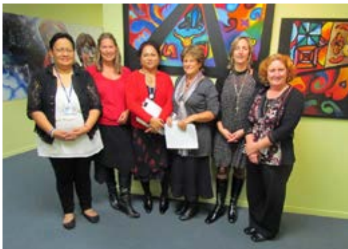
The Auckland DHB VIP kaitiaki group

"He Kāmaka Oranga have always helped us deliver our training. This gives a strong message that we're all responding to family violence together but now our relationships are even stronger. Our VIP team is predominantly Pākehā so building relationships