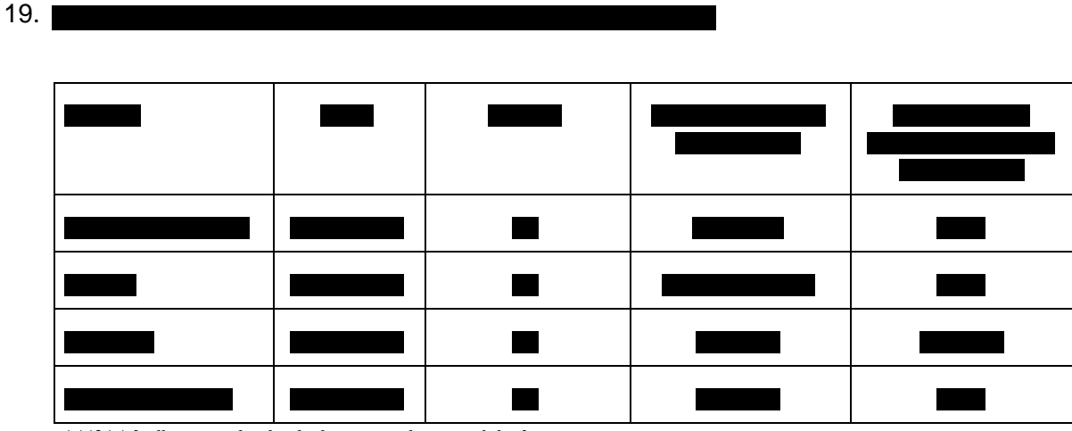
9(2)(f)(ii) [collective and individual Ministerial responsibility]

20. The map in appendix one shows the location of each of the four short-listed options in relation to the existing hospital site.